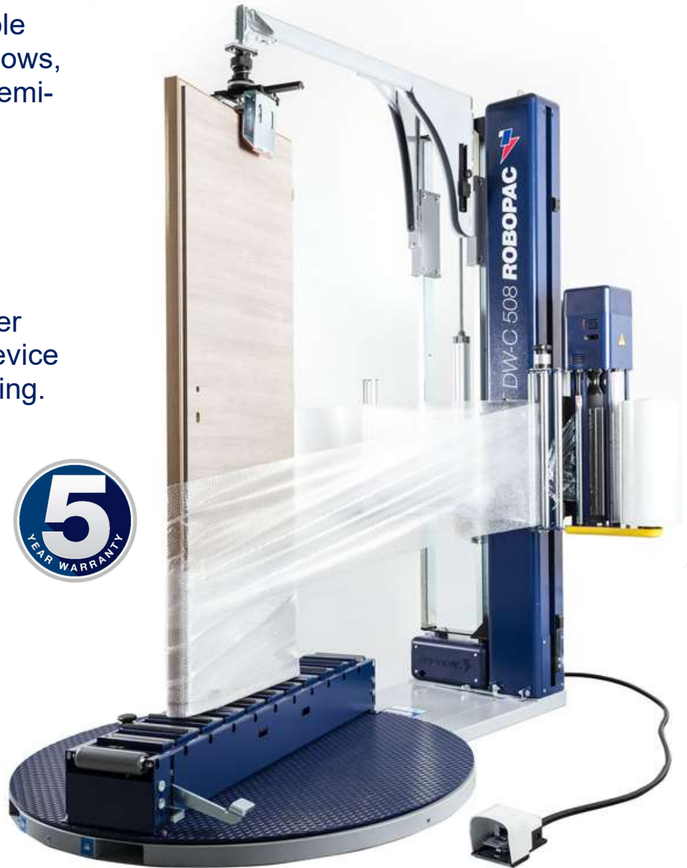
*Rotoplat 508 DW-C shown