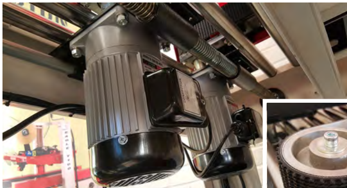
1/4HP Dual Industrial Motors