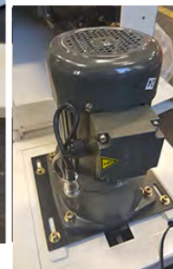
1HP Electric Motor