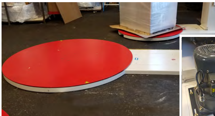
(28) Heavy-Duty Sealed Bearing Nylon Rollers