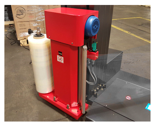
Film Carriage Assembly