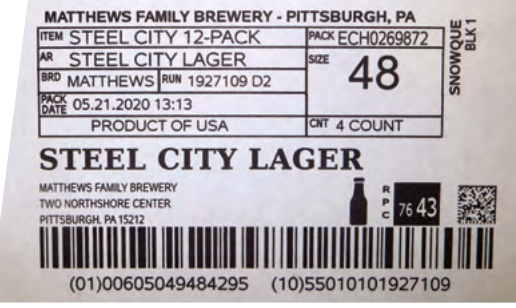
L50 mark on white corrugate