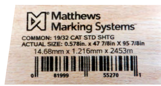
L50 mark on plywood