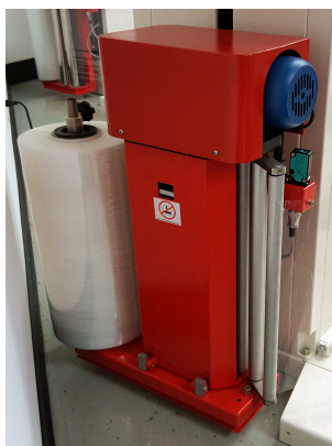
Film Carriage Assembly