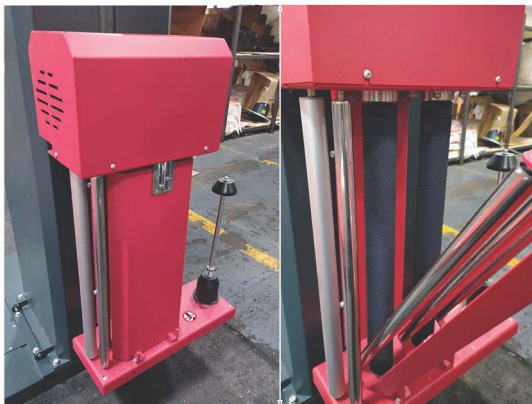
Film Carriage Assembly