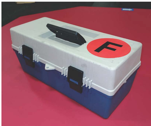
Tool Kit and Internals

* 3-year parts warranty * (unlimited cycles)